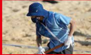
Cooling vest supplied to Games staff