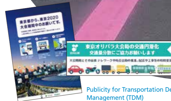
Publicity for Transportation Demand Management (TDM)

Our initiatives included reinforcing infrastructure including airport capacity and roads, reducing transportation demand through the promotion of remote working, and adopting an IT-based transport operation support system to facilitate the transportation of athletes and Games staff, all of which served as significant steps forward in our future plans to enhance city functions.