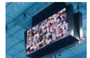
5G-based remote spectating