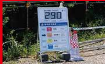
Wet Bulb Globe Temperature (WBGT) signage for announcing the WBGT heat index