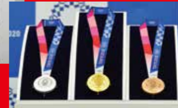
Approximately 5,000 medals were produced from recycled metals.