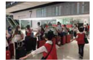
Playbooks were compiled for rigorous management of health and behavior.

The materials and technologies developed for athletes, such as the heat-insulating asphalt pavement and lightweight technology for wheelchairs, have been applied in areas other than sports.