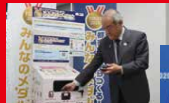
Tokyo 2020 Medal Project: Towards an Innovative Future for All

Aiming to transform sustainability awareness and practices, we made use of recycled metals and plastic and utilized hydrogen.