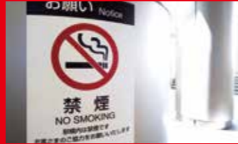
Measures against passive smoking